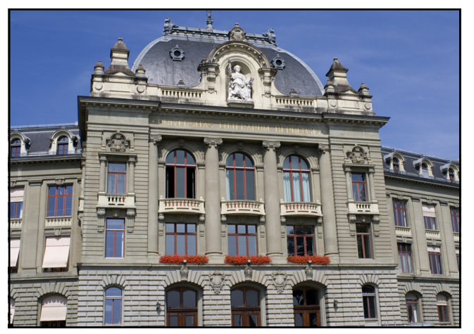
Figure 1. Hauptgebäude, the venue of the 24th European Congress of Arachnology.

the shortest possible time. This presentation was followed by a well-illustrated talk by Peter Michalik (Greifswald, Germany) on the male genital system of Oonopidae (9 species were studied), with lots of electronic images and nice colourful reconstructions. The unpaired testis was hypothesized to be a new synapomorphy for the goblin spiders.