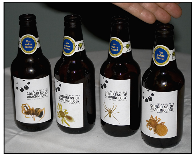
Figure 4. Examples of the bottles with 'arachnological' beer, empty of course.