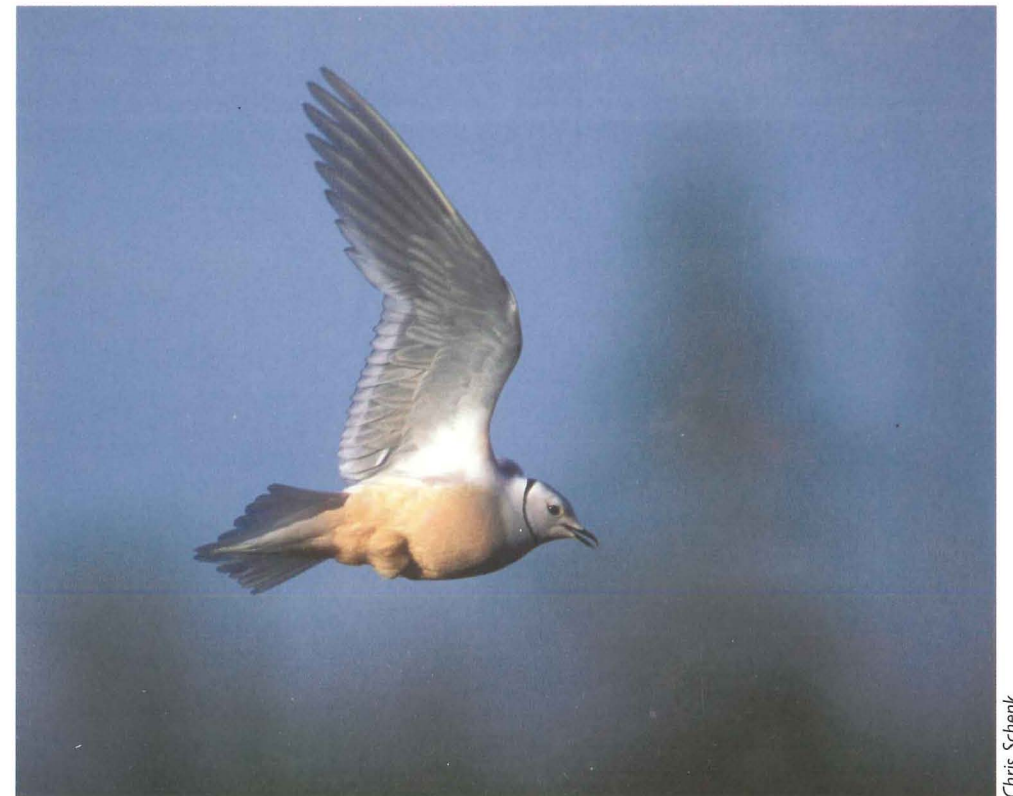
378. Ross's Gull Rhodostethia rosea , near the Indigirka River, northeast Siberia, June 1999.