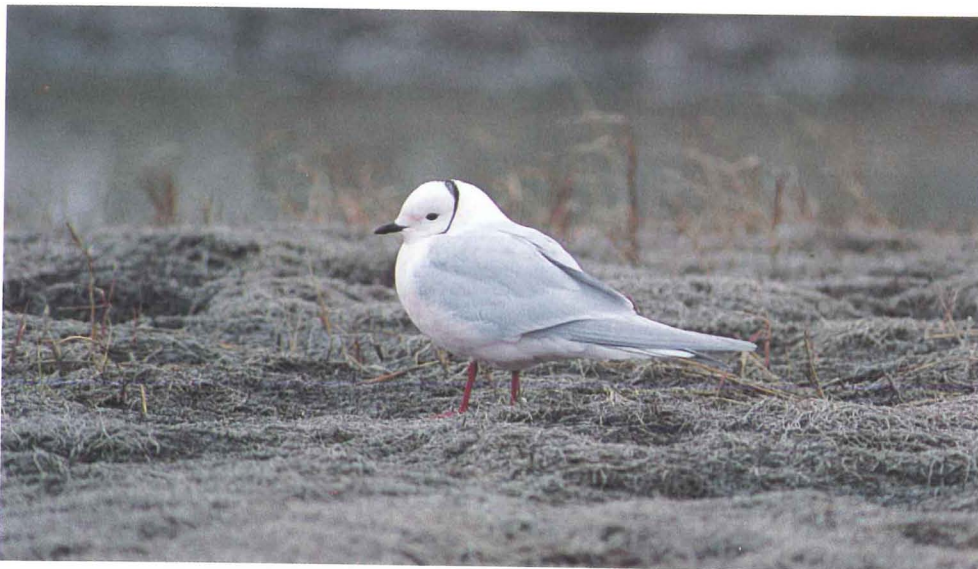
370. Adult Ross's Gull Rhodostethia rosea near the settlement of Chokurdakh, on the lower Indigirka River, northeast Siberia, June 1994.

The study colony was located in a marsh on