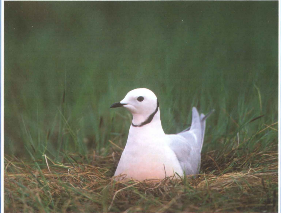
366. Ross's Gull Rhodostethia rosea, near the Indigirka River, northeast Siberia, June 1999.