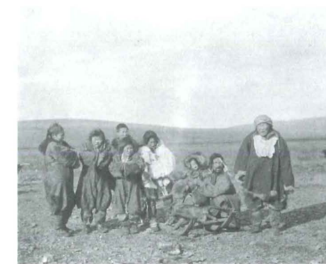
369. 'NE Siberia, tundra E from the mouth of Kolyma, a Chukchi's family', photographed during Buturlin's 1905–06 expedition.