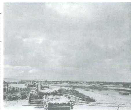
368. Pokhodsk village, with the Kolyma River in the background, photographed during Buturlin's 1905–06 expedition.

Buturlin set up camp on 8th May in the small village of Pokhodsk, by the Kolyma River, a settlement founded by orthodox Old Believers (plates 368 & 369) in the time before Peter the