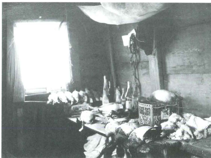
372. Photograph of the inside of Buturlin's hut in the Kolyma delta, 1905, showing, on the table and windowsill, the birds collected on his trip; marked on reverse by Buturlin 'NE Siberia, Kolyma's delta, vil. Pokhodskoe, 69°7'N, a room, where we prepared bird skins. Near the window four skins of adult Rhodost. Rosea , and four of their pulli. The photograph shows stuffing material and preserving spirits.

Since the discovery of the first nest, additional colonies of Ross's Gulls have been discovered in Arctic Siberia, along the Alazeya, Indigirka, Yana and Lena Rivers (Dement'ev & Gladkov 1969; Degtyarev et al. 1987; Densley 1991), and the breeding population is estimated to be in the region of 45,000–55,000 adults (Degtyarev 1991). Occasional breeding has occurred west to the Taimyr Peninsula (Pavlov & Dorogov 1976; Yésou 1994) and east to the Chaun River delta (Pearce et al. 1998), but these attempts seem to have been erratic and opportunistic. More surprisingly, there have been breeding attempts beyond Siberia, at Isfjorden, Spits-