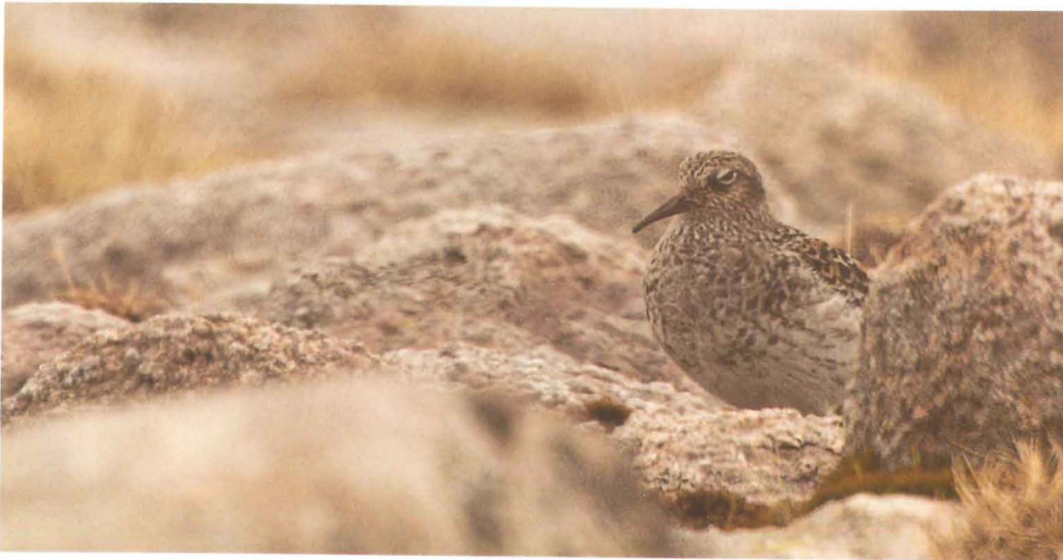
365. Purple Sandpiper Calidris maritima , Scotland, June 2004.