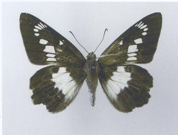
Fig. 1 コンゴウセセリ Satarupa nymphalis ♀ from Bychikha, Khabarovsk

Few days later, July 14, he collected one more female (Fig. 1) from herb flowers on a narrow artificial glade in a mixed forest on a protected nature reserve territory, in 1 km S of Bychikha. All known collecting places of this species are mapped on Fig. 2.