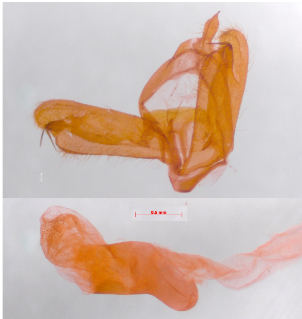
Fig. 9. Dolgoma recta , male genitalia, paratype, Thailand. Рис. 9. Dolgoma recta , гениталии самца, паратип, Таиланда.

forewing androconial scales beyond the discal vein on the forewing upper surface. By the male genital structure, the new species is characterized by a shorter and apically constricted cucullus and a long apical process of sacculus which touch each other at their apices. In G. serva the cucullus apex is broader, not constricted, and noticeably more protruding than the sacculus apex. The vesica shape differs significantly in both species: it is short and globular in the new species and strongly tubular in G. serva Wlk. The cornutus shape is also different, straight and massive in the new species, while in G. serva Wlk. it is twice as narrow and curved basally.